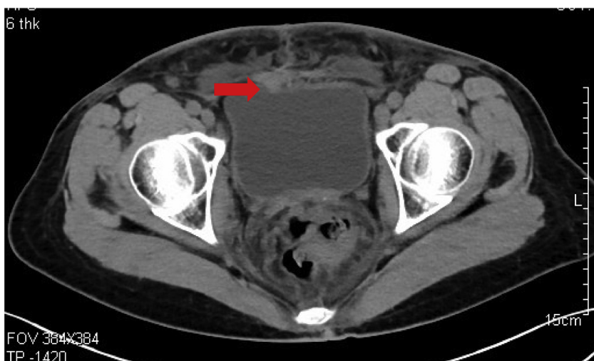
Fig. 1. Computed tomography revealed a small lesion on the superior wall of the urinary bladder.