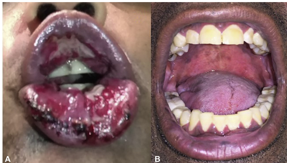
Fig 3. Case 3: bullous erythema multiforme. A , Erosions and hemorrhagic crusts on lips and oral mucosa; (B) normal mucosa following thalidomide therapy.

complete and durable remission of mucosal and skin disease (Fig 3, B). Prednisone, methotrexate, and hydroxychloroquine were gradually withdrawn.