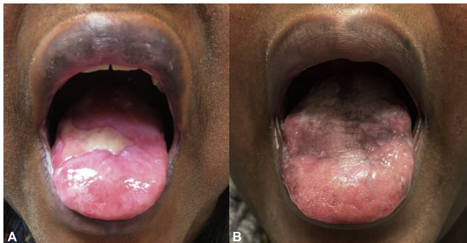
Fig 1. Case 1: bullous erythema multiforme. A , Bulla and erosions on the dorsum of the tongue. B , Reepithelialization with hyperpigmentation following thalidomide therapy was observed.

remission of all disease (Fig 1, B). Prednisone, methotrexate, dapsone, and valacyclovir were gradually withdrawn during a period of 6 months. The patient has remained disease-free on thalidomide (200 mg daily), as a monotherapy during the ensuing 9 years. It is noteworthy that mild flares occurred on 2 separate occasions when the thalidomide dosage was lowered.