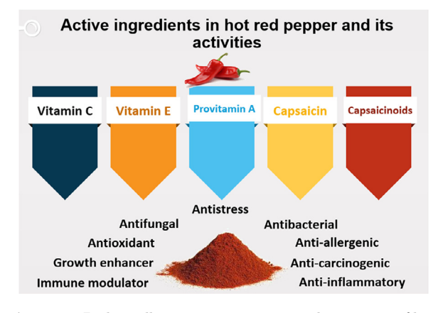
Figure 1. Biologically active constituents and properties of hot red pepper.

Several reports confirmed the activities of these compounds, including antimicrobial, anthelmintic, antioxidant, growth enhancer, and immune modulator activities (Lokaewmanee, 2019). However, their phytogenic effect depends on their herbal characteristics, the