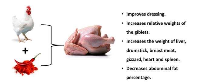
Figure 3. Impacts of hot red pepper supplementation on carcass characteristics.

Many studies recorded no significant differences or decreased dressing percentages and liver, heart, gizzard, and abdominal fat weights, or both of broiler chickens between HRP-treated birds and controls (Azouz 2001; Al-Kassie et al., 2011c; Afolabi et al., 2017; Islam et al., 2018; Soliman and Al-Afifi, 2020). El-Deek et al. (2012) also reported a significant decrease in the abdominal fat