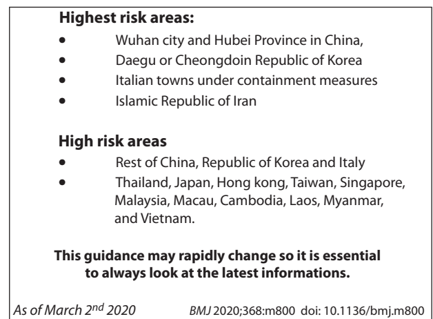
Figure 1. Risk assessment by country.

The median estimated incubation period of the virus is about of 5.5 days, with a range from 0 to 14 days. Robust evidence coming from China and Italy confirms that about