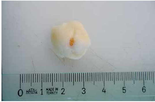
Figure 3. The wound excised with surrounding tissue and photographed for area measurement

four groups (Table II); however, angiogenesis was higher in all treatment groups compared to the control group, although the difference was not statistically significant ( p = 0.65 ).