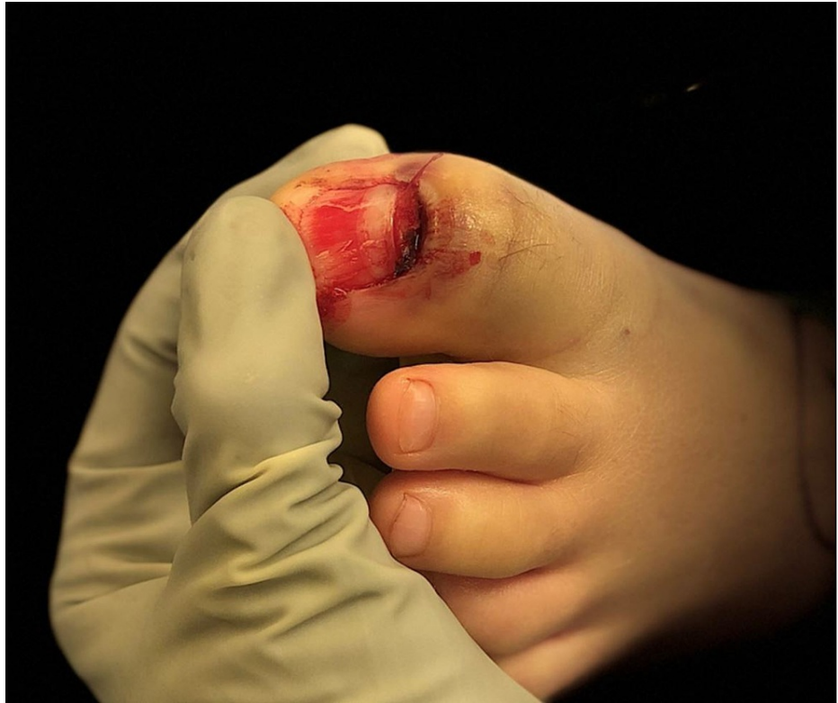
FIGURE 2: Intra-operative photograph of the left great toe demonstrating a dorsal laceration and avulsion injury of the proximal nail bed with exposed fracture and germinal matrix.

Following an unsuccessful attempt at reduction under digital block in the orthopedic clinic, the decision was made to proceed with urgent operative intervention for management of the patient's open Salter-Harris I fracture with an interposed germinal matrix. Intraoperatively, the patient underwent nail removal where it was noted the germinal matrix was completely interposed within the physal separation. To retract the interposed tissue, two 5-mm back cut incisions were made on the medial and lateral borders of the eponychial fold. Then, the proximal aspect of the eponychium was elevated dorsally and the matrix was exposed. The fracture was cleared of interposed tissue, irrigated with sterile saline, then reduced and stabilized with a 0.054 Kirschner-wire (K-wire) (Figure 3). The nail was then replaced following the reduction and stabilization of the fracture.