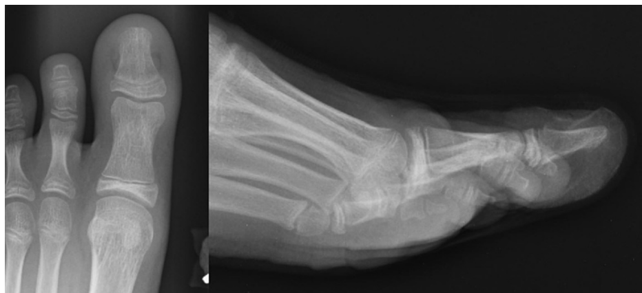
FIGURE 4: AP (left) and lateral (right) radiographs of the left great toe six weeks post-operatively demonstrating interval removal of the Kirschner-wire and maintenance of reduction with healing of the Salter-Harris I fracture of the distal phalanx.

The patient was allowed to be weight-bearing as tolerated after surgery in a post-op shoe and instructed to complete the full course of cephalexin previously prescribed for a total course of 10 days. He followed up one week post-operatively, and his wounds appeared to be healing well without signs of infection. He was instructed to follow up at six weeks post-operatively for K-wire removal. He followed up three weeks post-operatively for evaluation after accidental removal of the pin at home. Radiographs at that time demonstrated appropriate healing of the fracture, and physical examination did not demonstrate concern for infection. He remained in a post-op shoe for protection until six weeks post-operatively. Final radiographs at that time demonstrated good healing with anatomic alignment, and he was able to transition into a regular shoe and activities without complication (Figure 4). The patient was instructed to follow up at three months post-operatively but the appointment was canceled because he did not have any concerns and he has not required subsequent re-evaluation.