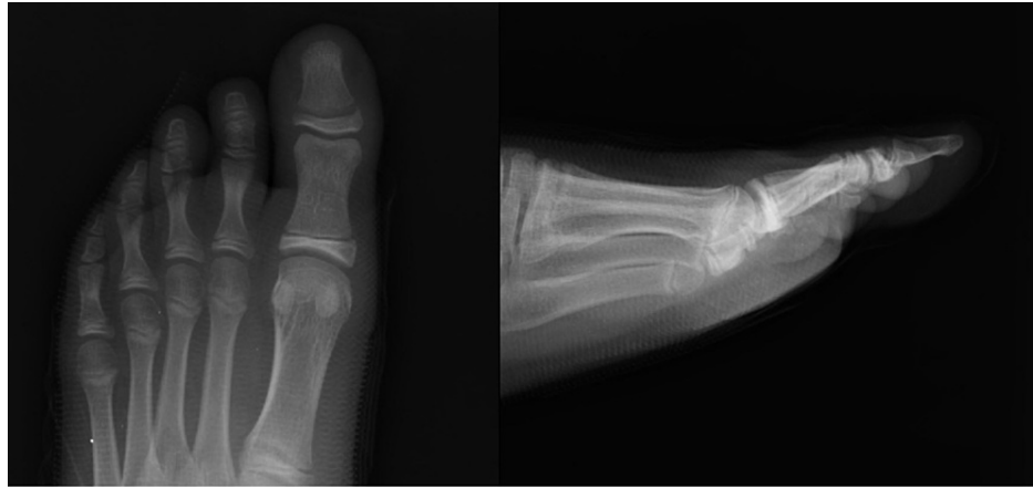
FIGURE 1: AP (left) and lateral (right) radiographs of the left foot in a 13-year-old male after stubbing his great toe, which demonstrates a Salter-Harris I fracture of the distal phalanx with dorsal displacement, plantar angulation of about 10°, and widening of the dorsal aspect of the physis.