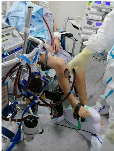
Figure 2 Patient cycling bedside with the multidisciplinary team.

Extracorporeal Membrane Oxygenation is regarded as a salvage therapy for critical patients in the acute setting. Decreases in cardiorespiratory and musculoskeletal function commonly occur in patients on ECMO support because of immobilization and prolonged bedrest (4). Early physical therapy is crucial, and has been demonstrated to be safe and feasible in our patients. The goals for physiotherapy management include avoiding atelectasis, airway clearance, weaning and increasing the functional level. In this report, we discuss a successful early physical therapy intervention in a COVID-19 patient on ECMO. We present the following article in accordance with the CARE reporting checklist (available at https://atm.amegroups.com/article/view/10.21037/atm-22-177/rc ).