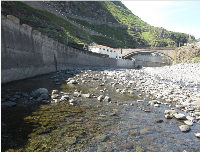
Figure 4. doi

Sampling site representing an urban land-use. Located at Ribeira da Janela, Porto Moniz (MAD21).