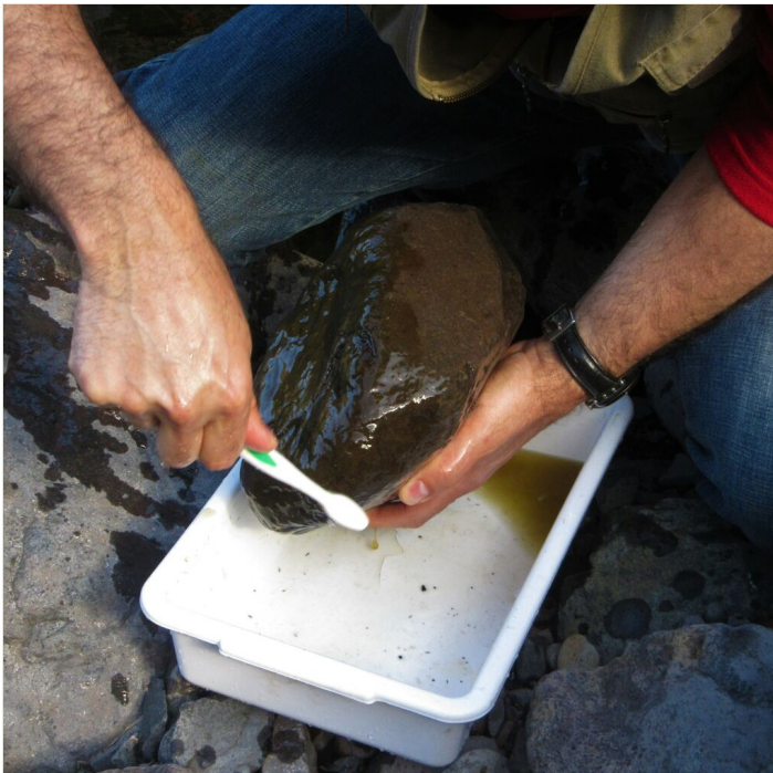
Figure 5. doi

Sampling site representing an urban land-use. Located at Ribeira da Janela, Porto Moniz (MAD21).