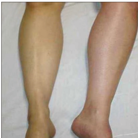
Figure 1: Case of phlegmasia cerulea dolens of the lower limb

In the Echo Doppler performed from the left foot, the DVT was seen extending to the external iliac. The patient's d-dimer level was >10,000. Other laboratory factors are also reported in Table 1. The patient's electrocardiogram was also normal [Figure 2]. Intravenous, arterial color Doppler ultrasound of the left lower limb revealed that the common and superficial, popliteal, posttibial, and ant tibialis femoral arteries had normal intima-media thickness and common, superficial and popliteal femoral arteries had normal peak systolic velocity (PSV) and normal spectral waveforms. The dorsalis pedis artery had normal PSV and biphasic waveform, and in the study of the left lower extremity, common femoral vein (CFV) had an increased diameter and no normal compressibility. The hyperco image of the heterogeneity of thrombus was seen on the