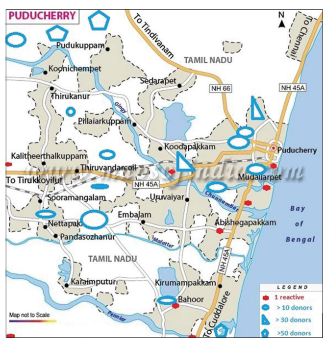
Figure 2: The catchment areas of the donors in our study and location of positives detected

In Puducherry, the monsoon is typically from July to September. The months following or the post-monsoon months, usually October to December, extending to January end or early February months, are the ones that have subnormal rainfall with high humidity. A previous study has studied the occurrence of dengue fever in relation to climate variables in Puducherry, wherein a maximum number of cases were recorded during October to December with a peak during November and a gradual decline after that.<sup>[15]</sup> Usually, the vector Aedes aegypti is shown to have two types of breeding foci; primary and secondary. Usually, the primary foci are formed during the heavy rainfall in the monsoon and pre-monsoon. During the post-monsoon, when the temperature decreases, leading to decreased evaporation, the secondary reservoirs are formed due to stacked water and rampant secondary breeding foci, which cause increased cases during this period.<sup>[16]</sup> Similar patterns