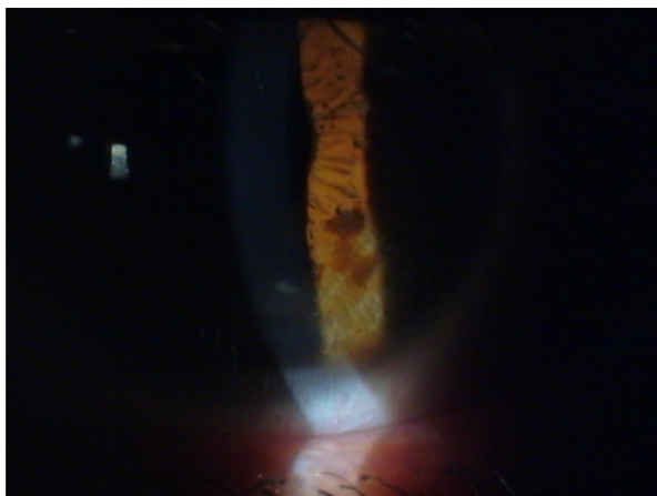
Figure 3 Inferior paracentral epithelial erosions which developed as a complication of using the optimal piggyback contact lens fitting system successfully for a 7-month period.

patients. 11 Lens comfort and stability may be increased with other fitting options by the use of hybrid lens designs, scleral lenses, and piggyback lens systems. However the relatively low oxygen transmissibility and high cost of the hybrid lenses and lack of experience with scleral lenses limit their use. 12