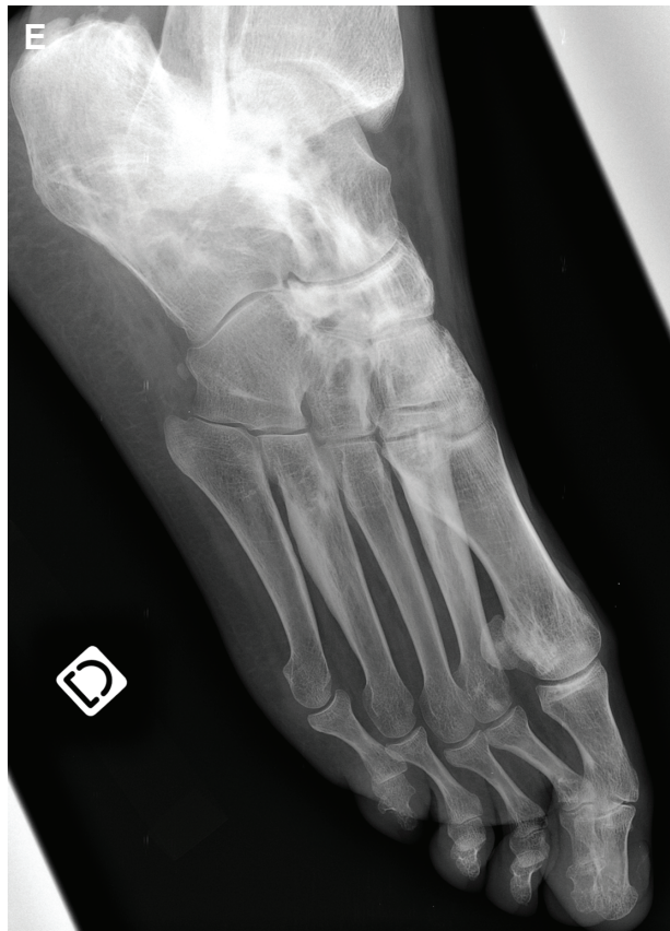
Figure 1 (Continued)

Over the next 5 years, the evolution of the condition was marked by an increase in pain and its extension to both the lower limbs, with a persistent predilection for the right side.