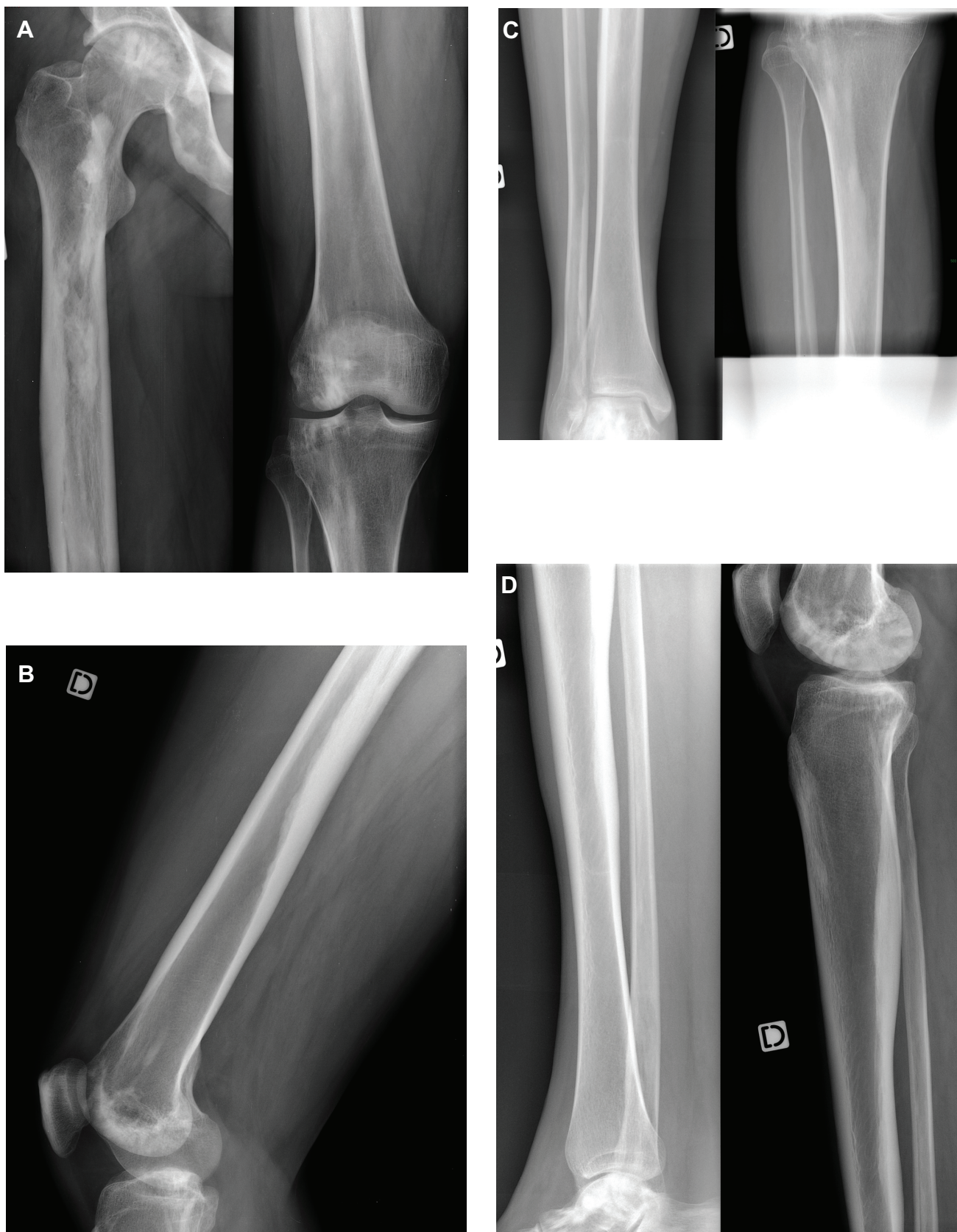
Figure 1 (A) and (B): anteroposterior and lateral views of the right femur showing dripping cortical hyperostosis. (C) and (D): anteroposterior and lateral views of the right tibia evidencing tibial cortical hyperostosis. (E): lateral view of the right foot showing heterogeneous osseous condensation of the heel.