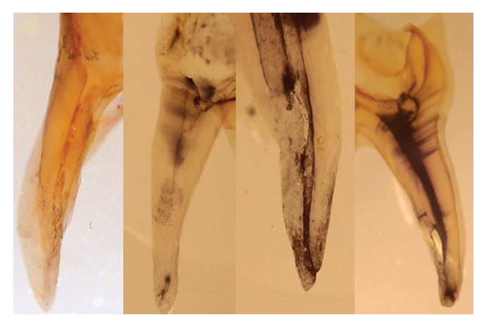
Fig. 1: Grading 0, 1, 2, and 3 of canals after making the tooth transparent for analysis

The teeth were decalcified by immersing them in 7% hydrochloric acid for 2 days. The acid solution was changed each day. After decalcification, the teeth were washed under running water. The teeth were then immersed in a series of diluted ethyl alcohols for dehydration: Initially in 70% alcohol for 16 hours (changed every 8 hours) followed by 80% alcohol for 8 hours, 95% alcohol for 8 hours, and 100% alcohol for