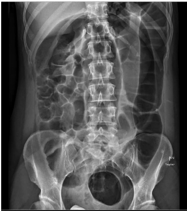
Fig. 1. Abdominal x-ray showing very dilated colon down to the rectosigmoid junction.