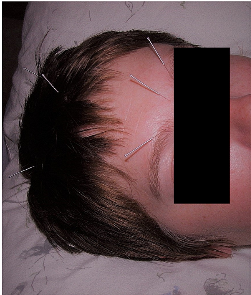
FIGURE 3: Example of common acupuncture points on the head

The image is adapted from Facial acupuncture by Mscaprikell (2005): https://www.flickr.com/photos/mscaprikell/10972762/sizes/l/ . CC BY-SA 2.0.