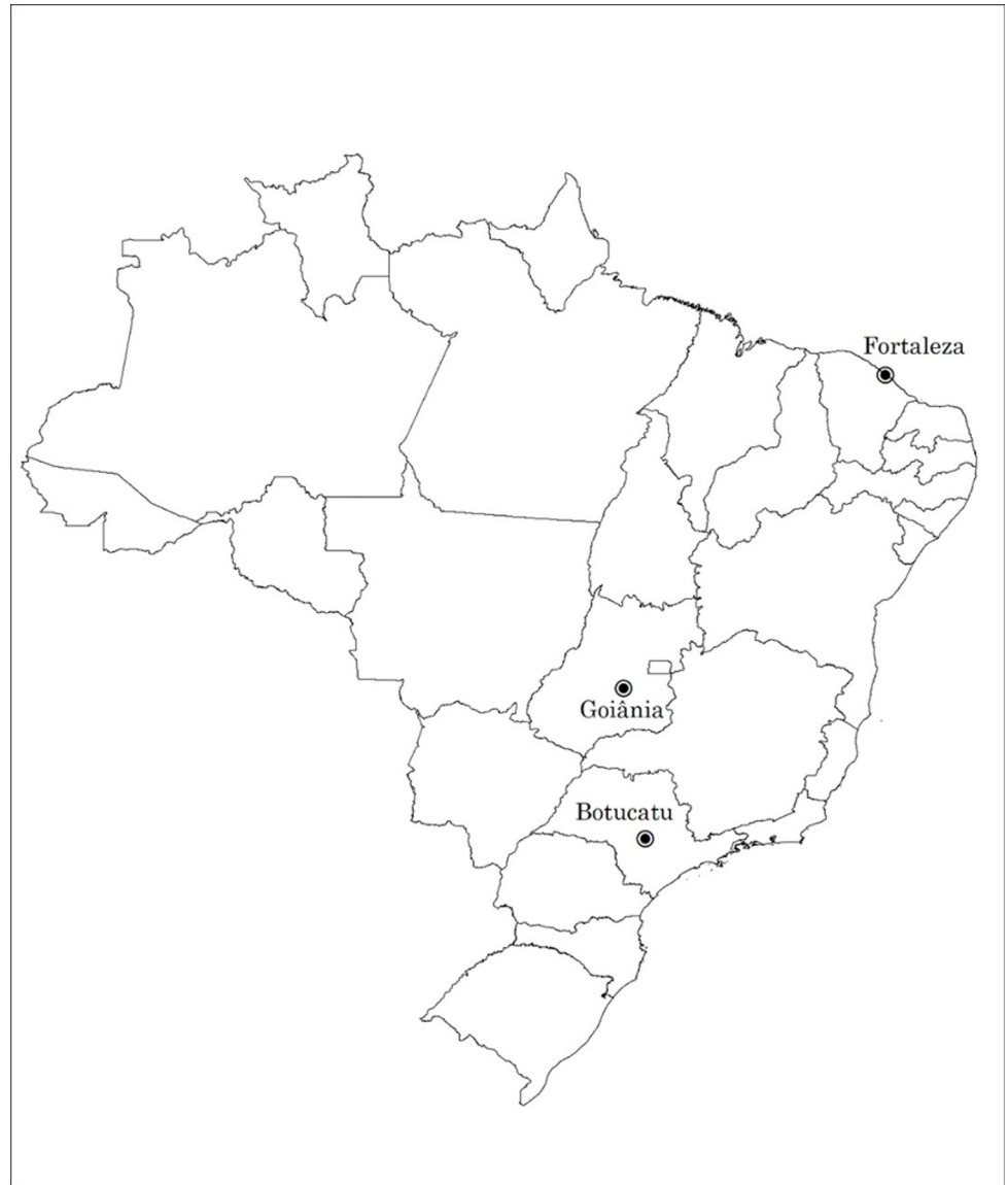
Fig 1. Map of Brazil, showing the cities that host the study hospitals. Note. This figure copyrights belong to the authors. Figure was drawn in ArcGIS 10 (ESRI, Redlands, CA).

https://doi.org/10.1371/journal.pone.0255593.g001