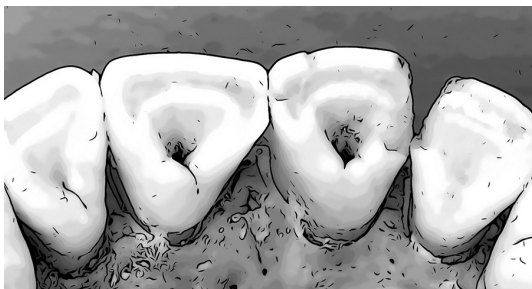
FIGURE 2 Illustration of the lingual view of human maxillary central incisors with a high degree of incisor shovel-shaping. Among humans, this topography varies from flat to the highly curved configuration seen here. Illustration based on image courtesy G. Richard Scott

EDAR is one of the death receptors in the tumour necrosis factor receptor superfamily that evolved 350–450 million years ago. 18 Not all of the death receptors are involved in programmed cell death. Some have evolved over many millions of years to utilise the same signalling pathways for other roles. For example, the ectodysplasin pathway includes NF- \kappa B signalling to regulate gene expression involved in the development of ectodermally derived epithelial structures. 18 This co-option is fascinating because the main role of NF- \kappa B signalling is to regulate pro-inflammatory responses and support innate immune