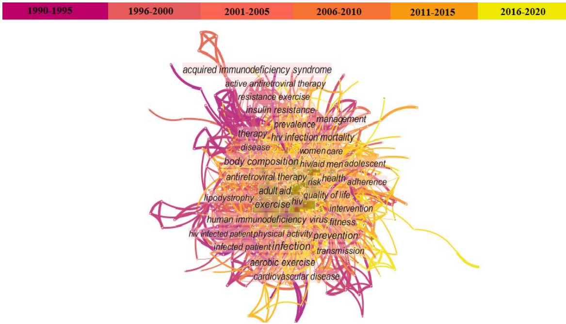
Fig. 3: Keywords analysis