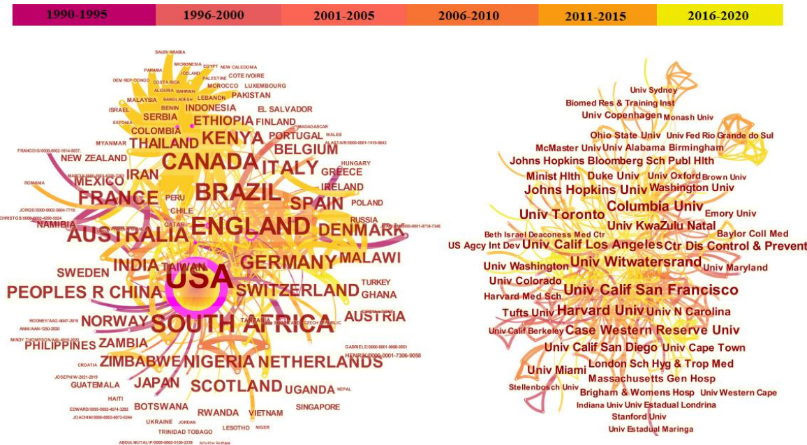
Fig. 1: Institution and country collaboration

connections between nodes gave insight about the collaborations. The colors in the network represented the collaborations and the density of collaborations between nodes in parallel with the time scale shown at the upper side of the Fig. 1. The size and thickness of the circle around the nodes exhibited the centrality level of the actor in the network.