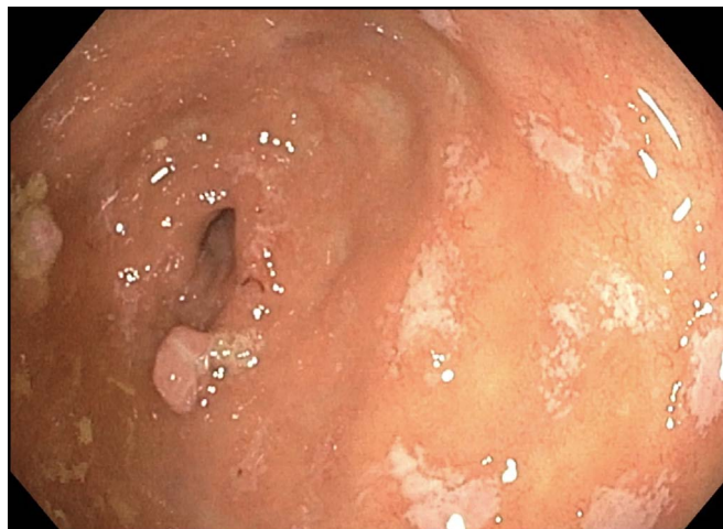
Figure 2. Colonoscopy showing patchy ulcerated mucosa, erosions, and inflammatory polyps in the rectum and cecum consistent with Crohn disease.

A magnetic resonance enterography demonstrated thickening and hyperenhancement of the colon and distal small bowel, in keeping with an inflammatory process. There was no obvious small bowel wall thickening or focal stricture. The transverse colon was dilated. There was increased fluid within the peritoneal cavity with no evidence of an abscess or mass. Given these findings, the decision was made to treat with corticosteroids as an induction agent for indeterminate colitis in a pediatric patient. He was started on a prolonged taper of oral prednisone (40 mg daily, tapered by 5 mg weekly) with good response. However, he had a recurrence of diarrhea when the prednisone dose was weaned. A repeat colonoscopy showed moderate colitis, similar to his previous colonoscopy. Thus, he was transitioned to a treatment regimen of infliximab (5 mg/kg/dose at 0, 2, 6 weeks, and then every 8 weeks) and oral methotrexate (12.5 mg weekly), the recommended treatment for refractory Crohn disease in a pediatric patient. Despite the initiation of a biologic, he did not achieve remission (with persistently elevated inflammatory markers), necessitating a dose escalation of infliximab to 10 mg/kg/dose. With the dose escalation, the inflammatory markers trended down, and the