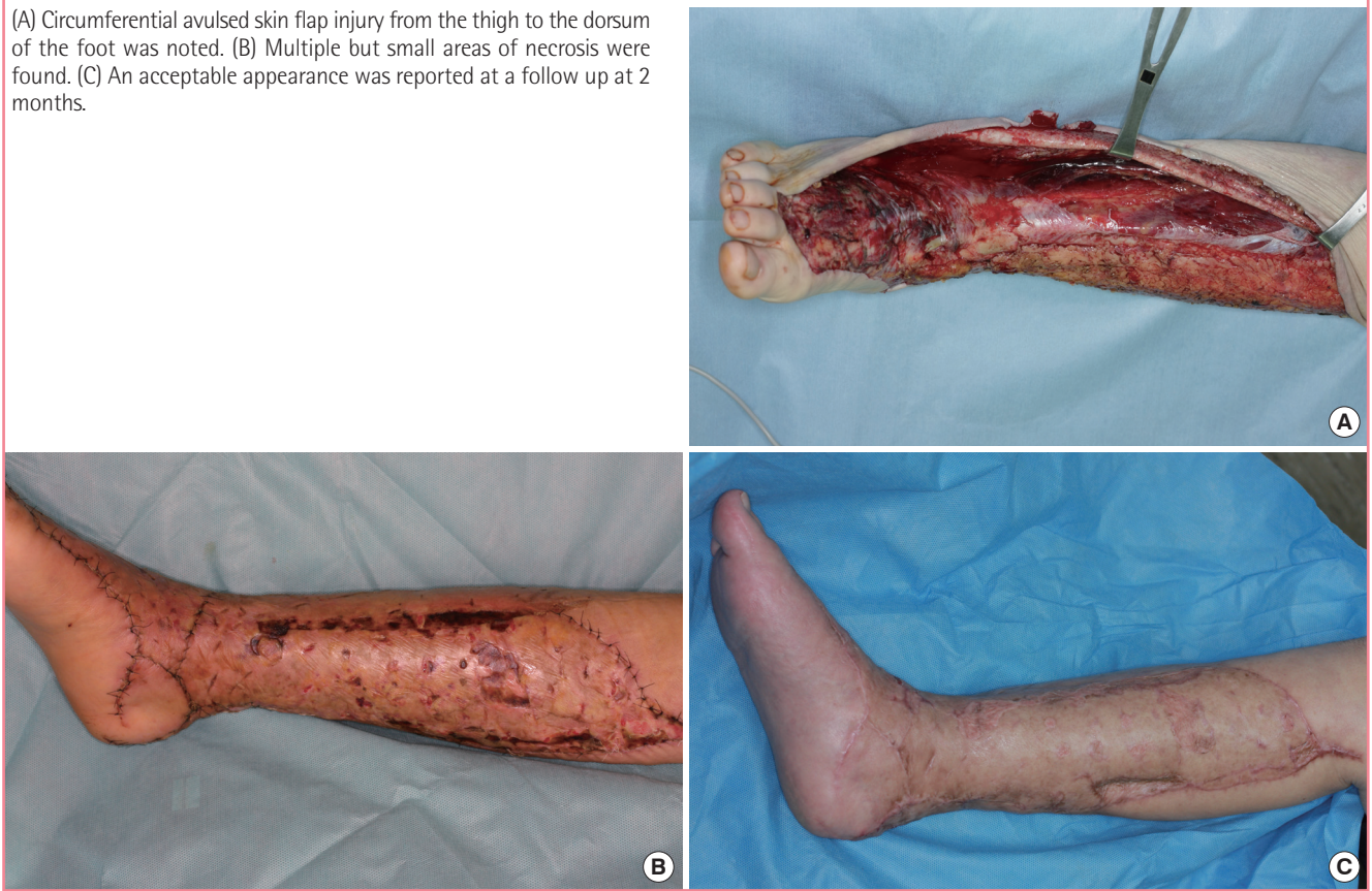
Fig. 3. Case 2: preoperative and postoperative photographs

(A) Circumferential avulsed skin flap injury from the thigh to the dorsum of the foot was noted. (B) Multiple but small areas of necrosis were found. (C) An acceptable appearance was reported at a follow up at 2 months.