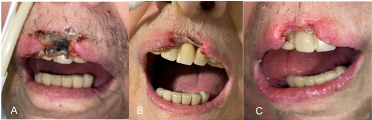
Fig. 3 A 2.0-cm ulcer on the upper lip

IOT into extensive ulcerated lesions, necrosis, and the loss of tissue. Such lesions can lead to disfiguration, difficulty of speech and eating, affecting the quality of life of these patients [16]. Furthermore, large areas of oral ulcers in immunocompromised patients can increase the risk of life-threatening systemic infections.