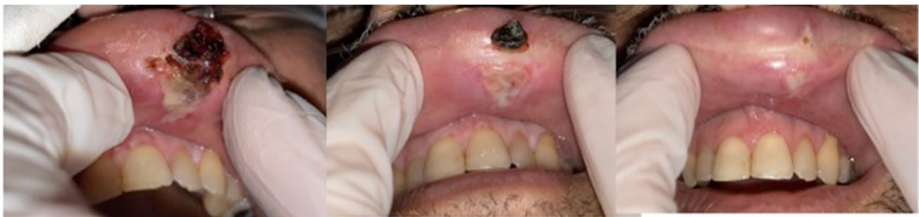
Fig. 1 Number of patients evaluated at the ICU from May 2020 to February 2021 and distribution of oral alterations in that period. OTI, orotracheal intubation

The selected patients must have been managed with the oral care and the PBM protocol. Males and females, age > 18 years, were included, and the patients must have had a diagnosis of a traumatic lesions or be at risk of oral lesions of traumatic etiology. In addition, patients that received OTI, tracheostomy (TQT), hospitalized for 7 days or more, maintained in a pronated position or after proning, and diagnosed with any pathological lip changes in oral cavity were also included. The purpose of the initial evaluation was to assess oral health status. Any changes in the oral cavity, presence of outbreaks of infections, and active oral/dental disease were recorded. The information of periodic follow-up must also have been recorded in the patient record.