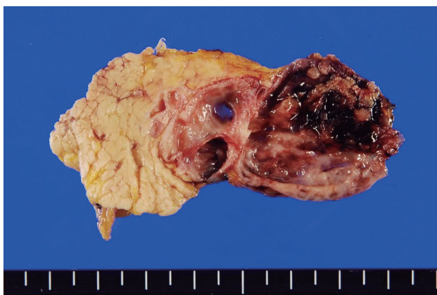
Figure 2. Macroscopic appearance of the resected pancreas (4.4 × 4.4 × 3.7 cm). Sectioning revealed a multilocular cyst filled with mucinous and necrotic material was found.

On day 6 after surgery, the patient complained of