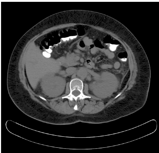
Fig. 2. Abdominal CT demonstrating perinephric infiltrate bilaterally, giving a “hairy kidney” appearance.

The most common clinical findings associated with ECD involve long bones, retroperitoneum, large vessels and the central nervous system, however up to 50% of patients are initially asymptomatic.