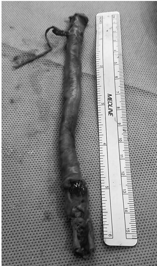
Fig 1. The avulsed iliofemoral artery. Adherence of the SoloPath sheath to the diseased artery by the stents caused complete avulsion from the common iliac artery (CIA) to the femoral bifurcation.

With the patient hemodynamically stable, a 7-mm Gore polytetrafluoroethylene graft was sewn to the left femoral bifurcation. A needle was introduced through the bypass graft into the Viabahn stent, through which a stiff guidewire was placed. Over the guidewire, the tract was dilated with an 8F sheath, and a series of 8-mm Viabahn stent grafts were telescoped into the established left-sided Viabahn grafts and into the bypass graft. These were postdilated to gain apposition, allowing inflow into the bypass.