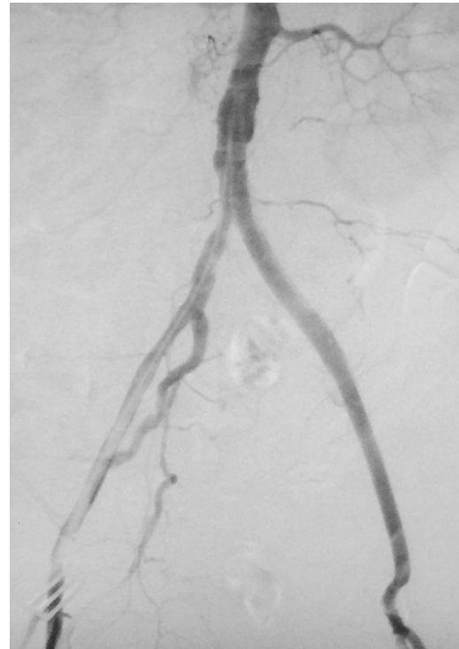
Fig 2. Completion angiogram shot from the contralateral femoral artery demonstrating excellent flow through newly constructed hybrid iliofemoral conduit to left lower extremity.

On postoperative day 1, the patient underwent emergent left leg four-compartment fasciotomy because of compartment syndrome, likely contributed to by 3 hours of leg ischemia from an occlusive sheath and clamping during avulsion management. The fasciotomy was successfully closed 2 weeks after initial surgery. After a lengthy intensive care unit stay, the patient was discharged 6 weeks postoperatively, ambulating fully and at baseline mental status.