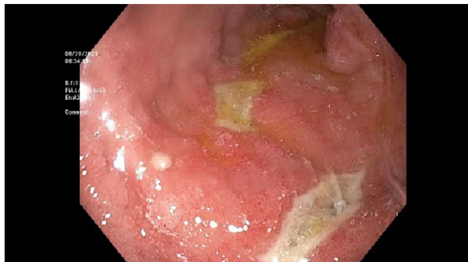
FIGURE 4: Duodenal ulcerations on repeat Esophagogastroduodenoscopy (EGD).