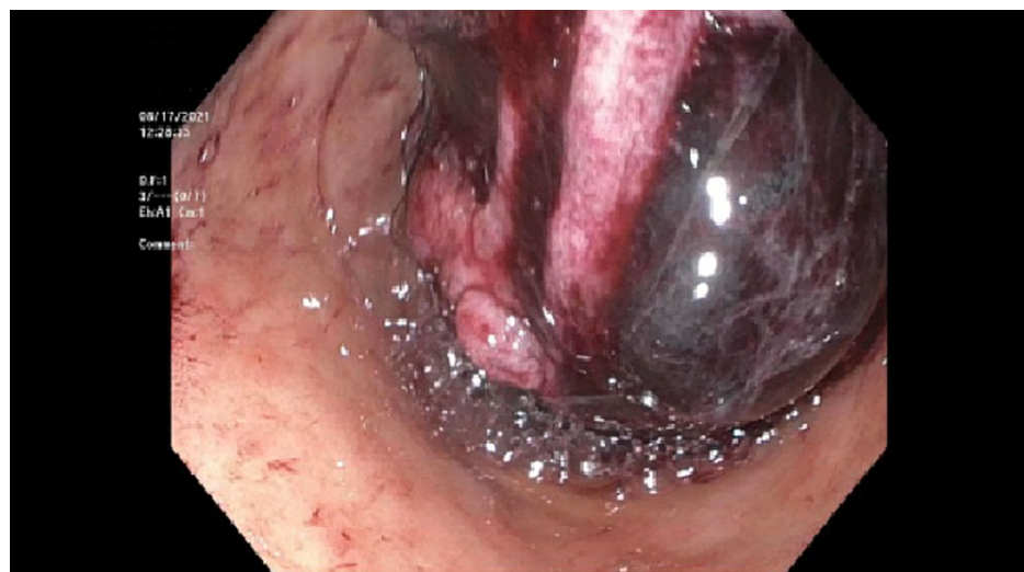
FIGURE 2: Blood clot obstructing the pylorus during initial Esophagogastroduodenoscopy (EGD).