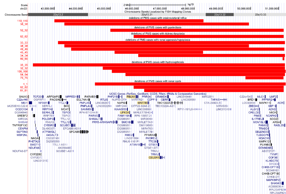
Figure 2. Deletions for individuals with PMS with renal disorders by type of disorder. Figure created from UCSC Genome Browser [37,50]. Red bars show the deleted regions. Renal disorders of unspecified type are not shown. Genes highlighted in yellow are candidate genes for renal disorders in PMS.