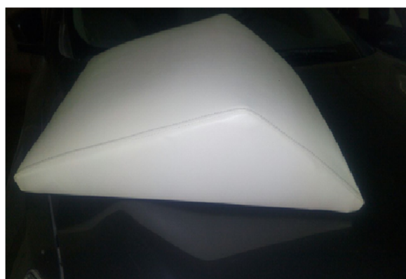
Fig. 1 The special pillow designed for achieving modified ramped position (Hasanin Pillow)

This randomized controlled study was conducted in Cairo University Hospital after institutional board review