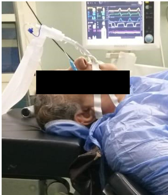
Fig. 2 The ramped position

The special pillow was removed after confirming successful intubation.