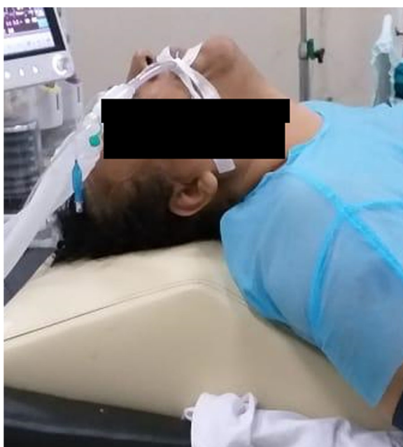
Fig. 3 The modified ramped position

Incidence of difficult laryngoscopy defined as “failure to insert the laryngoscope in the oral cavity due to large breasts with the need to reposition the patient to insert