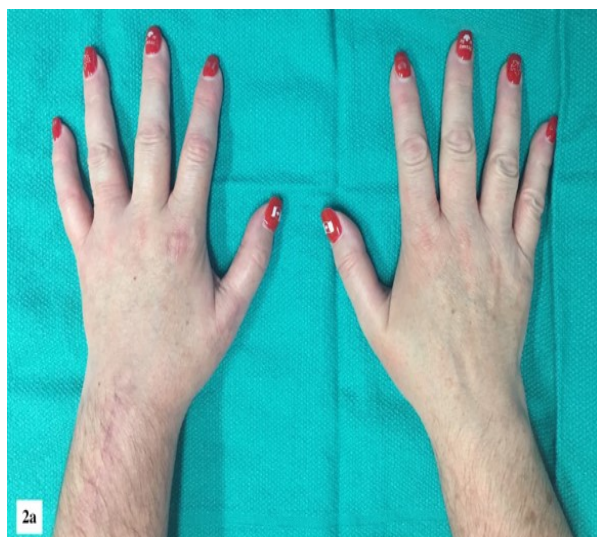
Figure 2: Resting position of hands, with incisions on the operated side (left) and maintained thumb extension out of the plane of the palm.

A 48-year-old, right hand dominant female sustained a fracture of the left distal radius. She underwent open reduction and internal fixation 10 days after injury with a volar locking plate. Approximately 2 months after surgery, she described a “pop” in the wrist and was subsequently unable to extend the thumb out of the plane of the palm. She continued with rehabilitation but eventually presented to our institution due to persistent limited range of motion (ROM) 3 months post-operatively. Clinical evaluation confirmed deficiency of the EPL tendon while extension to the remaining digits was maintained (including independent extension of the index and small fingers). Radiographs revealed solid union of the fracture and a volar plate with prominent dorsal screws (Fig. 1). Magnetic resonance imaging (MRI) was performed by the referring physician, but this was of limited utility due to metal artifact from the plate and screws. As a result, the musculoskeletal radiologist report could not conclusively confirm continuity or discontinuity of the extensor tendons.