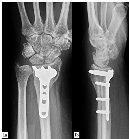
Figure 1: Distal radius fracture with prominent dorsal screws, anterior-posterior, and lateral views.

this study, we present a case of concomitant EPL and extensor digitorum communis (EDC) to the index finger (EDC II) tendon rupture after locked volar plating of the distal radius. The purpose of this article is to describe this complication as well as strategies for diagnosis, treatment, and prevention.