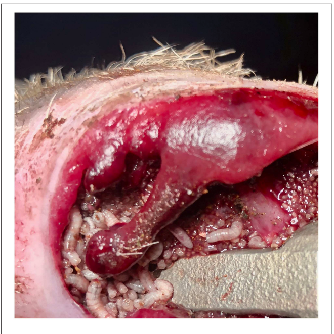
FIGURE 4 | Skin-implant junction infested with larvae of the screwworm fly.

the junction between the skin and the implant. It was observed that the subsequent infection with sanguinepurulent discharge affected the skin and subcutaneous tissue around the prosthesis ( Figure 4 ). Treatment for the screwworm fly consisted of aggressive tissue debridement, antibiotic therapy, pain management, and wound care. Under general anesthesia, with the same protocol as described previously, surgical debridement, and maggot removal was performed.