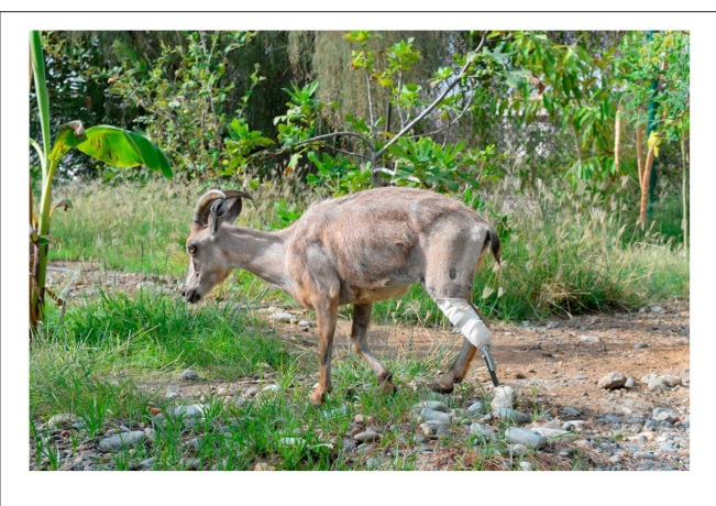
FIGURE 5 | Arabian Tahr 6 months after prosthesis implantation.

and clavulanic acid at a dose of 9 mg/kg (Synulox RTU Zoetis), and pain control with 7.5 mg meloxicam at a dose of 0.5 mg/kg (Meloxicam 5 mg/ml Troy Laboratories) every 24 h for the next 10 days. This combination of medicine administered post-treatment of the infection proved effective.