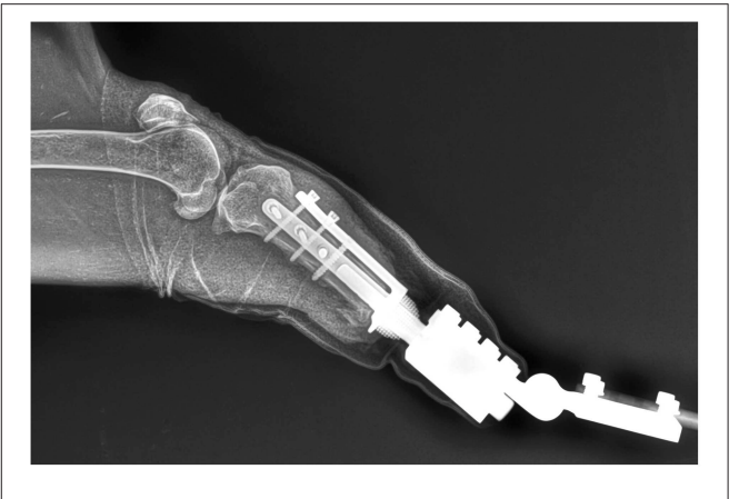
FIGURE 3 | Radiogram at 8 weeks after implantation.

Three months post-implantation a complication occurred. Larvae of the Old-World screwworm fly ( Chrysomya bezziana ), which feeds on living tissue, were found in