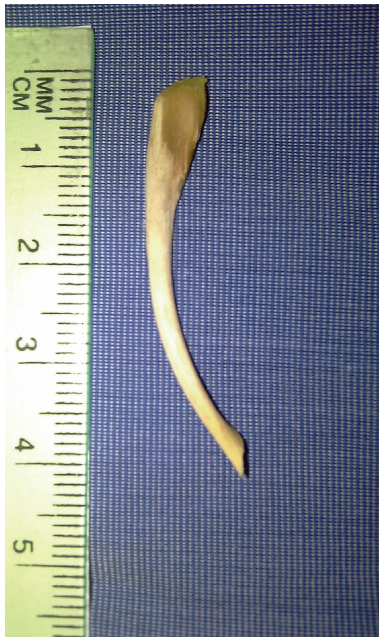
FIGURE 2: The chicken bone which was almost 4-cm-long after being successfully removed from the hypopharynx.

by a Magill's forceps, the patient's oro- and hypopharynx were adequately anesthetized. The patient was instructed to protrude his tongue and hold it by his hand with a piece of gauze. The telescope was held by the physician's left hand and introduced carefully into the oropharynx. When the foreign body was identified in the left pyriform fossa and clearly visualized on the monitor, it was carefully removed by a curved laryngeal forceps held by the right hand of the physician (Figure 2). After that, the patient was prescribed oral antibiotics in the form of Amoxicillin-Clavulanic acid (1 gm b.i.d. for 10 days) to control possible infection and an analgesic and anti-inflammatory drug in the form of Diclofenac Sodium (50 mg b.i.d. for 10 days). Then,