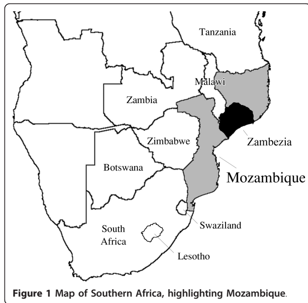
Figure 1 Map of Southern Africa, highlighting Mozambique.

from employment [14,16,17]. Barriers and solutions to improve adherence in rural areas has been well documented in Haiti and Uganda [5,8,14,18], but only one study has been conducted in rural Mozambique [8]. In some studies, adherence rates in Africa have been documented to equal or exceed those in Western countries [19], while other studies have raised concern with current adherence rates and the measurement tools employed [20]. Explanations for high rates of adherence include use of social networks of HIV positive patients to encourage all members to take medications [21,22], non-adherent patients were excluded from treatment given limited availability [23], or that some cART programs provided effective, but unsustainable services and incentives for patients [24]. Currently, all HIV-positive patients in Zambézia Province receive free health care services, but nutritional supplements, transportation assistance, and financial incentives are rarely available. The rural location of our clinical sites, coupled with comparatively low levels of adherence, suggested the need to learn more about perceived barriers to patient adherence within our clinical setting.