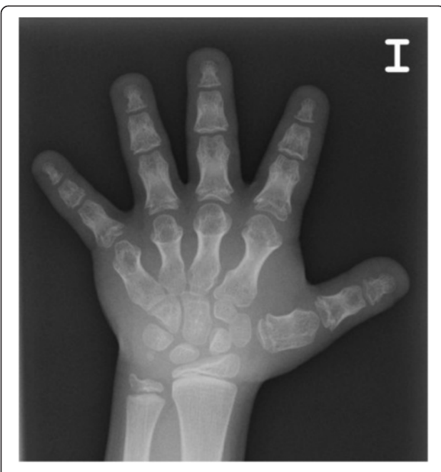
Figure 3 Hand of a patient with acrodysostosis and multihormonal resistance (OMIM#101800). Severe and generalized brachydactyly, through very short and broad tubular bones, including ulna can be observed. Metacarpals II-V are proximally pointed and cone-shaped proximal phalangeal epiphyses are prematurely fused. The general appearance of the hand is bulky and stocky.

increased mandibular angle, mandibular prognathism, epicanthal folds and hypertelorism (see Figure Three Pt.7, 8, 11 at Linglart et al. [44]). Advanced skeletal maturation, spinal stenosis, obesity, mental deficiency, notably delayed speech and impaired hearing are also frequently observed (Additional file 1: Table S4) [44-51]. Although Maroteaux & Malamut defined this pathology as a new