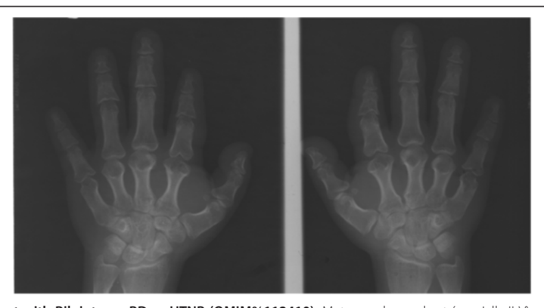
Figure 4 Hands of a patient with Bilginturan BD or HTNB (OMIM%112410). Metacarpals are short (specially II-V) with globular ends, irregular articular surfaces and cup deformity in the epiphysis of the proximal and medial phalanges. All the phalanges of the hands are also shortened, but the proximal and middle phalanges of the III and IV digits are relatively normal (courtesy of Dr. Sylvia Bähring and Dr. Okan Toka, unpublished case).

Bilginturan BD or hypertension with brachydactyly syndrome (HTNB, OMIM%112410) Bilginturan et al. were the first to describe this syndrome in a large nonconsanguineous Turkish family [54]. Subsequently, other authors have also studied this family and its new generations [55-66]. Affected members of the family had severe