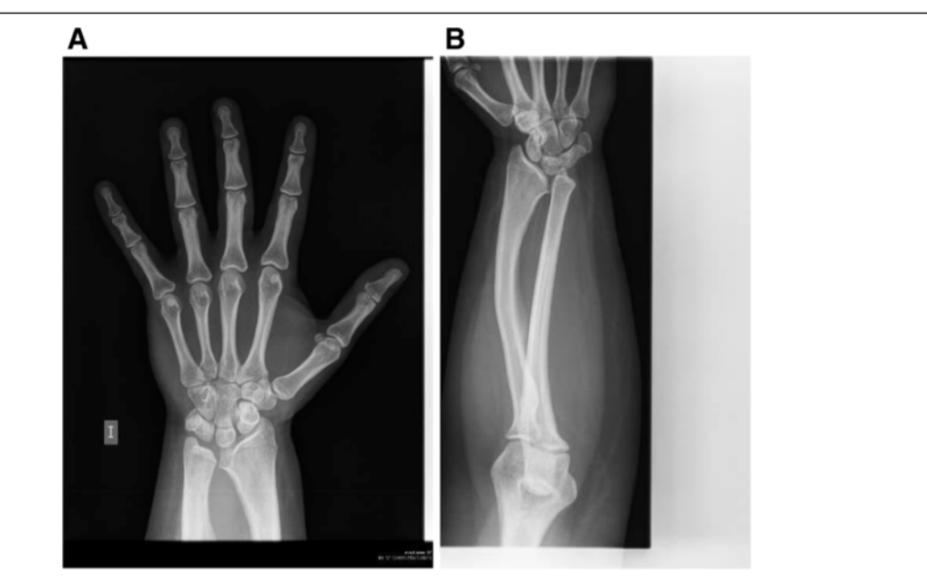
Figure 7 Hand (A) and radius (B) of a patient with Turner syndrome. It can be observed the ulnar and palmar slant of the radial articular surfaces, with a triangular appearance of the distal radial epiphysis and slight shortening of the IV metacarpal; the radius is short and bowed.