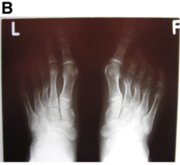
Figure 1 Radiographs of hands (A) and feet (B) of a non adult individual with heterozygous mutation in HOXD13(OMIM#113300). Shortening and widening of IV and V metacarpals are more evident in right; I, IV and V distal brachyphalangy, and mild clynodactyly of the distal phalanx of II and V, in left hand. In the feet, note asymmetrical shortening of the metatarsals: in right feet II, III, IV are shortened and in the left one, only III and IV. Note also, the clynodactyly of right hallux.