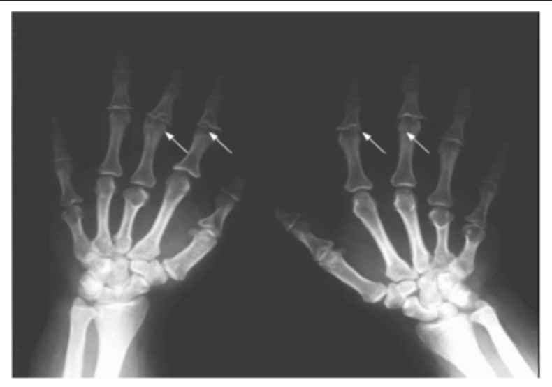
Figure 6 Hands of a patient with tricho-rhino-phalangeal syndrome I (OMIM#190350). The patient presents asymmetrical brachydactyly; metacarpals III and V are shortened on the left hand and IV and V on the right. Further, middle phalanges are shortened and cone-shaped epiphyses are shown with the typical outcarving and deformation (arrows).

Regarding brachydactyly, shortening of the metacarpals has been reported in about half of patients and cone-shaped epiphyses of middle phalanges, type 12/ 12A (only appreciable after infancy in early childhood, before epiphyses fuse), in almost all patients, in most cases in mesophalanges II and III. Outcarving and deformation of the cones is another striking feature and this is more easily appreciated after epiphysis fusion (Figure 6) [108,109]. In addition, ivory cones were reported by Giedion (again, a feature that is only appreciable after infancy in early childhood, before epiphyses fuse). Hypoplasia of the thumb, as well as shortening of metacarpals II-V and of middle phalanges II and V is frequently seen, although shortening of all middle phalanges has been also reported [101,106,108,110], as have small feet and a short hallux [110]. Poznanski et al. conducted MCPP analysis comparing PHP and PPHP with TRPS and found no similarity between pattern profiles in the two syndromes [20]. These data were published before the association of the syndrome with the TRPS1 gene. More recently, Lüdecke et al. used MCPP analysis to compare various groups of TRPS patients;