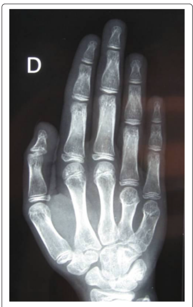
Figure 5 Right hand in a non adult individual with heterozygous mutation in PTHLH. Severe shortening of IV and V metacarpals is clearly observed (courtesy of Dr. Cécile Teinturier-Thomas, personal collection; Dr. Caroline Silve, molecular diagnosis, unpublished case).

As in the previous group, the pattern of brachydactyly varies considerably. Several authors have reported shortening of metacarpals III, IV and V in most cases, while proximal, middle and distal phalange involvement was variable and shortening and cone-shaped epiphyses on middle and distal phalanges II and V were frequently mentioned (Figure 5) [76,82,83]. In two cases (one patient with a deletion involving another 6 genes and the second a carrier of a small duplication), metacarpals I and II were also shortened [82,83], and in the case of translocation t(8;12) mentioned above, shortening of metacarpals I, III, IV and V was observed (Maass et al. ; IV:2 patient) [76].