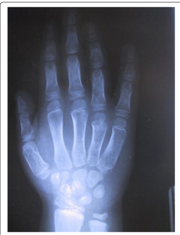
Figure 2 Hand of a patient with pseudohypoparathyroidism type Ia (OMIM#103580). Note the shortening of first metacarpal and proximal phalanx of the thumb and more severe shortening of metacarpals IV and V.

biallelic in most tissues, but paternal Gs \alpha expression is silenced in a few types of tissue (renal tubule, thyroid gland, hypophysis and gonads) [24-26] and this is important in the development of phenotypes associated with GNAS mutations. Maternal imprinting (and thus paternal expression) occurs on XL \alpha s, the large form of Gs \alpha , and two non-coding RNA molecules, the A/B transcript and the NESPas antisense transcript. On the other hand, paternal imprinting is seen on NESP55, a chromogranin like neuroendocrine secretory protein [27].