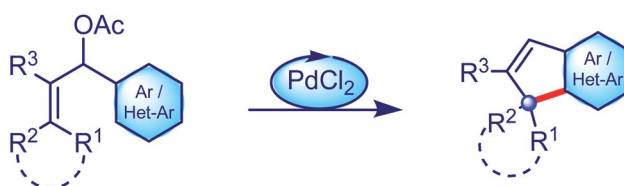
Scheme 1 General representation of the palladium-catalysed intramolecular allylic (hetero)arylation strategy reported by our group.

After the publication of our manuscript, a reader suggested that the transformation (shown in Scheme 1) can also be described as a Nazarov-type cyclisation 1 with palladium chloride acting as a Lewis acid. While we do not have any evidence at this stage to support the Lewis acidic behaviour of palladium chloride, 2 however, a Nazarov-type mechanistic scenario is possible. The overall transformation can also be considered as an intramolecular ene-type reaction 3 or as an intramolecular Friedel-Crafts-type reaction, 4 although our data agrees better with the 5-endo-trig process facilitated by the LUMO umpolung. 5 Further experimental and computational investigations are underway to elucidate the full mechanistic details.