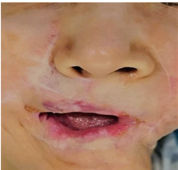
Fig. 2 - Nine months postoperatively.

The lack of any substantial fibrous framework increases the risk of anatomic distortion through wound contraction and, hence, leads to poor functional and esthetic outcomes [2]. The quality of the skin and mucosa of the lips is difficult to match with that of distant flaps; hence, local tissues provide the best results [3]. Various classical flaps have been used worldwide for lip reconstruction, including the Gillies fan flap, Karapandzic flap, Bernard-Burow-Weber flap, Jackson Technique, Abbé-Estlander flap and nasolabial flap, which reflect the overall inadequacy to suit every patient with any given defect [4-7]. To date, full-thickness skin graft, vascularized free flap, and adjacent flap are used for the repair of various lip defects. The adjacent flap that has a variety of designs which respect to the matched color, texture, and thickness of the defect area has been widely recommended. Most of these flaps may be the best choice for repairing lip defects; however, they are somewhat complicated to operate and require more incisions. Moreover, Asian patients have a higher tendency for scar formation after facial surgery; therefore, these techniques should be used secondarily [8]. In addition, skin laxity; sometimes makes repairing of certain defects convenient, and flaps mostly used in elderly patients are not applicable in young patients because of the aesthetic problems [9, 10]. Upper