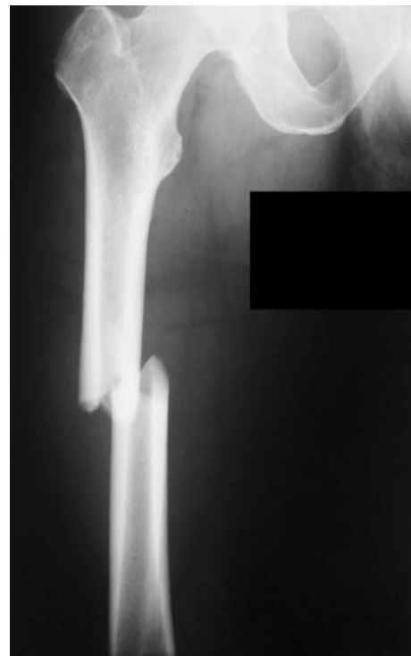
Fig. 2 A type A fracture