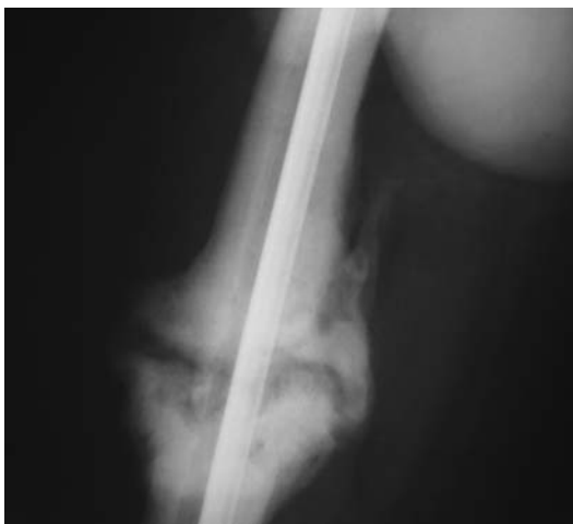
Fig. 4 Non-union

The complications in the three groups of patients are shown in Table 3. The incidence of intraoperative and minor post-operative complications was higher in type B and C fractures compared to type A, but was not statistically significant. The overall severe post-operative complication rates were statistically significantly higher in type B and C fractures compared to type A (17.9 and 23.7 vs. 6.7%, P = 0.002 ); in this regards, logistic regression analysis revealed that type B and C were associated with increased risk of complications, with respective odds ratios