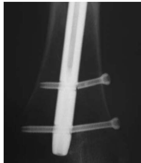
Fig. 5 Delayed union

The complications in the three groups of patients are shown in Table 3. The incidence of intraoperative and minor post-operative complications was higher in type B and C fractures compared to type A, but was not statistically significant. The overall severe post-operative complication rates were statistically significantly higher in type B and C fractures compared to type A (17.9 and 23.7 vs. 6.7%, P = 0.002 ); in this regards, logistic regression analysis revealed that type B and C were associated with increased risk of complications, with respective odds ratios