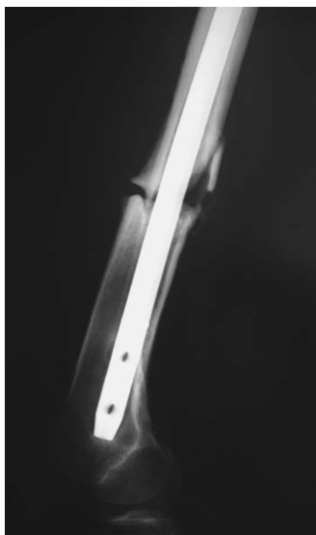
Fig. 7 Broken screws. In this case, the screws were of a cannulated type

smaller mean range of movement when compared with the other two types. There was a relation between a reduced range of motion and a history of patella and/or tibial plateau fracture, probably due to the necessity for open reduction and fixation of these fractures. Our study could not confirm any relation between decreased range of motion and the presence of an open fracture; this may be due to the small numbers of severe open fractures (3 IIIB and 1 IIIC). In addition, the guidelines followed for severe open fractures