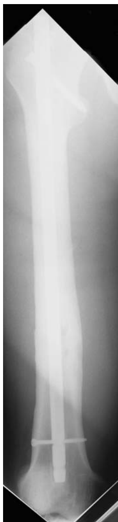
Fig. 3 The fracture treated with static intramedullary nailing technique