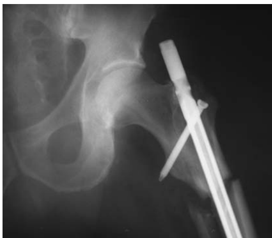
Fig. 6 Limb shortening/failed proximal locking screw