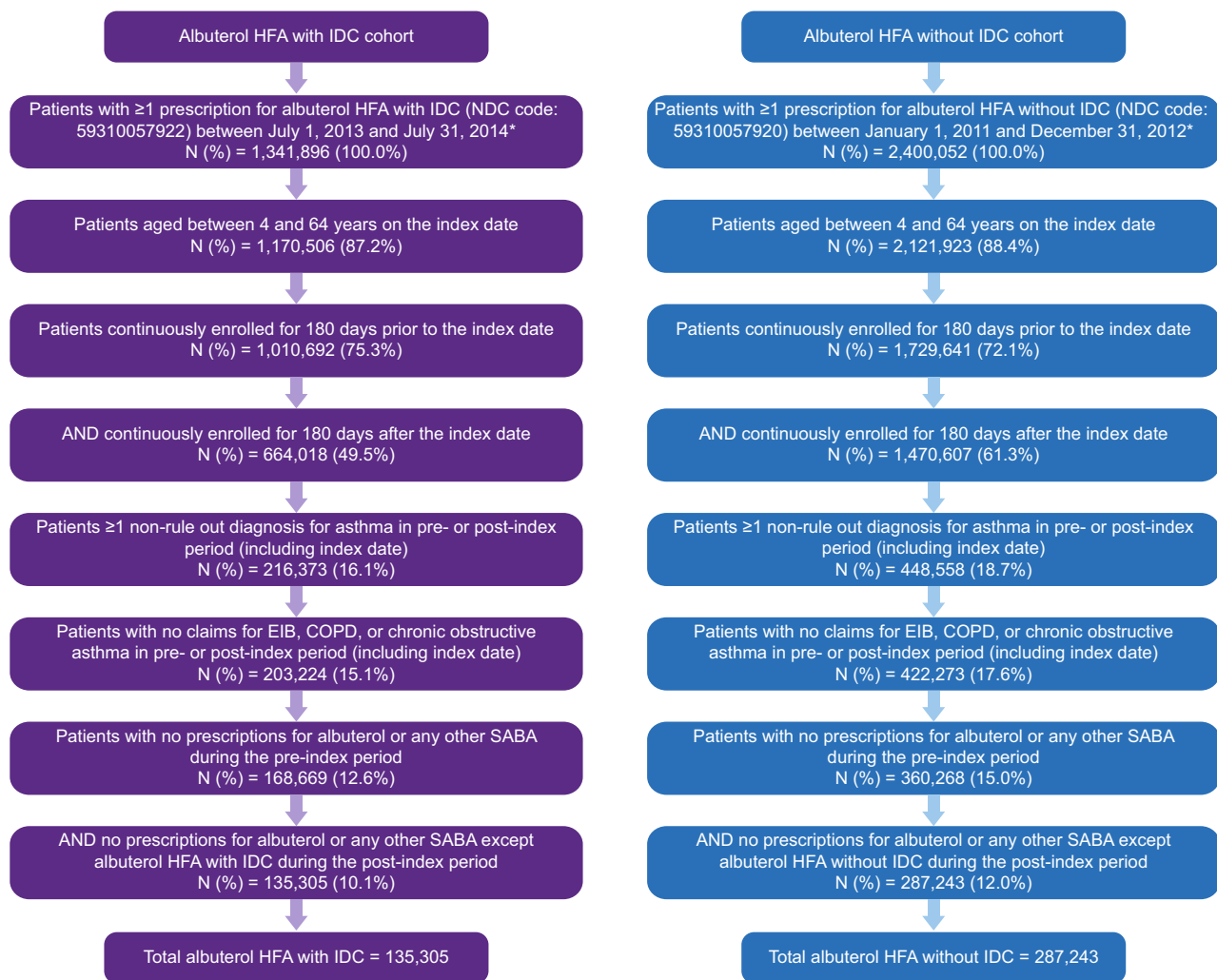
Figure 1 Patient selection.

Notes: *The date of first prescription for albuterol inhalation aerosol with IDC (albuterol with IDC cohort) and without IDC (albuterol without IDC cohort) was set as the index date.