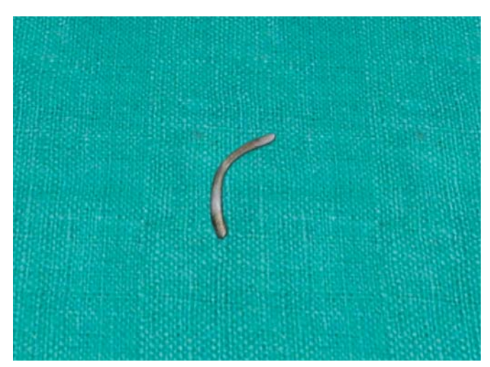
Fig. 4: Pin after removal

be lodged in the root canals and the pulp chamber, which ranged from pencil leads, 4 darning needles, 2 metal screws, 5 to beads 6 and stapler pins. 7 Grossman 8 reported retrieval of indelible ink pencil tips, brads, a tooth pick, adsorbent points. 8 A radiograph can be of diagnostic significance especially if the foreign body is radiopaque. McAuliffe 7 summarized various radiographic methods to be followed to localize a radiopaque foreign object as parallax views, vertex occlusal views, triangulation techniques, stereoradiography and tomography. Vertex occlusal view is no longer favored because of relatively high radiation exposure to the lens of the eye and because the primary beam is aimed toward the abdomen. Removal of foreign objects from the root canal is often a very difficult procedure. The procedure is even more complicated, if the foreign body is unusual.