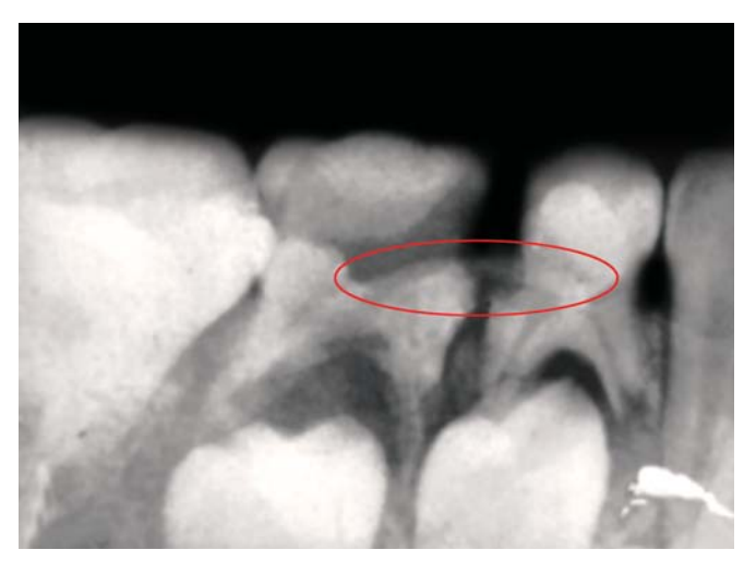
Fig. 2: IOPA radiograph showing radiopaque object in the canals of adjacent deciduous molars

An ultrasonic scaler was used to clear the debris from the root canal orifices and also to facilitate loosening of the pin. When the ball pin was adequately visible clinically, it was engaged with a tweezer and removed (Figs 3 and 4). Since the teeth were nonrestorable, so decision was made to extract the teeth under local anesthesia.