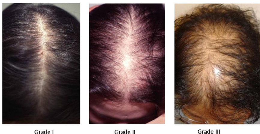
Fig. 2. Androgenetic Alopecia in Women. Ludwig Classification.

Weathering is defined as the cumulative effect of environmental factors on the physicochemical structure of the hair. Hair damage induced by environmental factors including UV, humidity, wind and chemicals in hair products and procedures, has a negative impact on the growth and texture of the hair fiber. Grooming habits and weathering interplay in the process of hair wearing and both can compound the natural