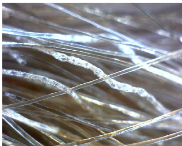
Fig. 4. Bubble Hair-Deformed hair shafts due to heat exposure caused by dryers and curling irons.