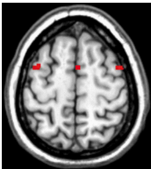
FIGURE 1 | Jointly recruited brain regions following a conjunction analysis between imagined and executed sub-maximum contractions of the elbow flexors ( p < 0.00001 FWE corrected). The recruited brain regions were in pre-motor cortex: x, y, z = 44, 4, 58, k = 19, T = 7.85 ; -38, 4, 56, k = 22, T = 7.72 and in the supplementary motor cortex (SMA): x, y, z = 8, 10, 64, k = 29, T = 7.62 . This indicates that imagery and executed sub-maximum contractions of the elbow flexors share common motor regions and thus we are able to address the research question of eccentric vs. concentric maximum contractions using motor imagery. Note: we also performed separate analysis to investigate if there were differences present between imagined and executed contractions. The results from that analysis showed that all regions recruited for the imagined task was present for the executed task. Moreover, for the executed task the T -values were in general stronger as well as the extent of voxels were larger. Also, primary motor cortex was recruited during the execution. These findings are in accordance with previous studies (e.g., Ehrsson et al., 2003).

In this study we used a blocked design, and three conditions (concentric, eccentric, and rest) were set up as separate regressors. Then single subject analyses were made using the general linear model and statistical parametric maps (SPMs) were generated through t -statistics. After that, random effects analyses