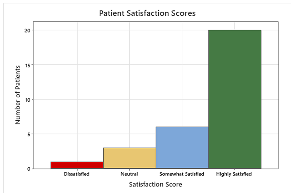
FIGURE 3: Patient satisfaction

When asked if they would undergo surgery again, one patient replied “no” and another was unsure; the remaining 28 patients would undergo the surgery again. In bivariate analysis, change in low back pain VAS was found to be a significant predictor of satisfaction (median change in VAS = 4; 95% CI, 3 to 5.7 satisfied vs. VAS change = 1; 95% CI, 0 to 2 not satisfied; Mood’s median test: P = 0.032 ). Improvement in weakness was also a significant predictor of patient satisfaction (Fisher’s exact test; P = 0.003 ). The final logistic model was found to be significant ( P < 0.047 ) and correctly predicted 93% of outcomes. In the final logistic regression model, only the change in VAS for low back pain was associated with patient satisfaction (odds ratio = 3.56, 95% CI, 1.02 to 12.44; P < 0.047 ).