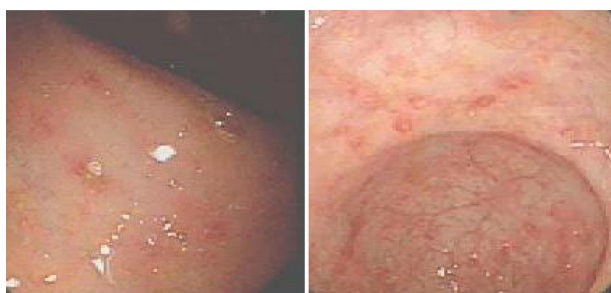
Figure 1 Colonoscopic picture showing aphthoid-like ulcers, granularity, and pin-point ulceration with fibrin deposits.

S. stercoralis is an intestinal nematode of humans. Although most infected individuals are asymptomatic, 19,20 S. stercoralis is capable of causing a fulminant illness that is often fatal if not recognized and treated. This is seen in certain conditions associated with a decrease in host immunity, including immunosuppressive therapy (particularly the use of glucocorticoids), hematological malignancies, bone marrow and renal transplants, human T-cell lymphotropic virus