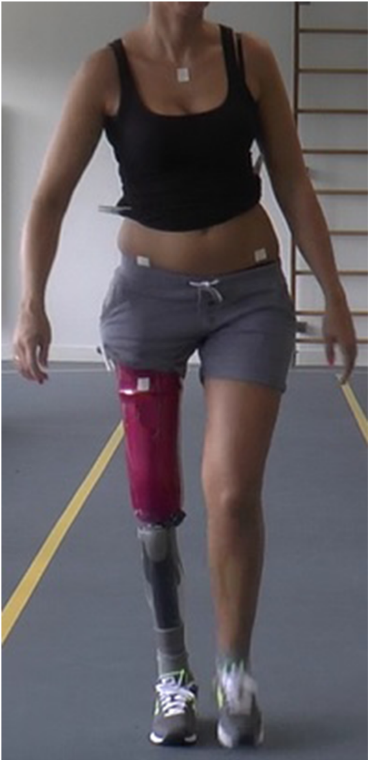
Fig. 3 Position of the tapes