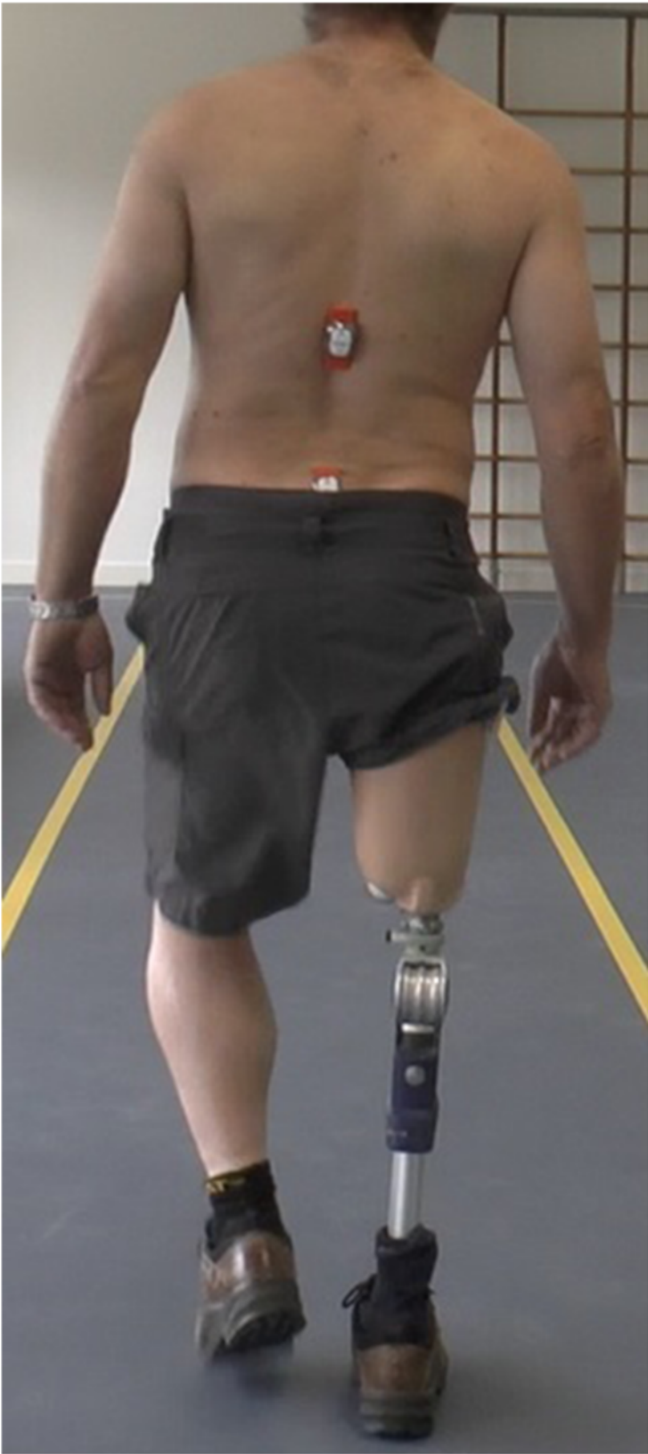
Fig. 4 Position of the gyroscopes