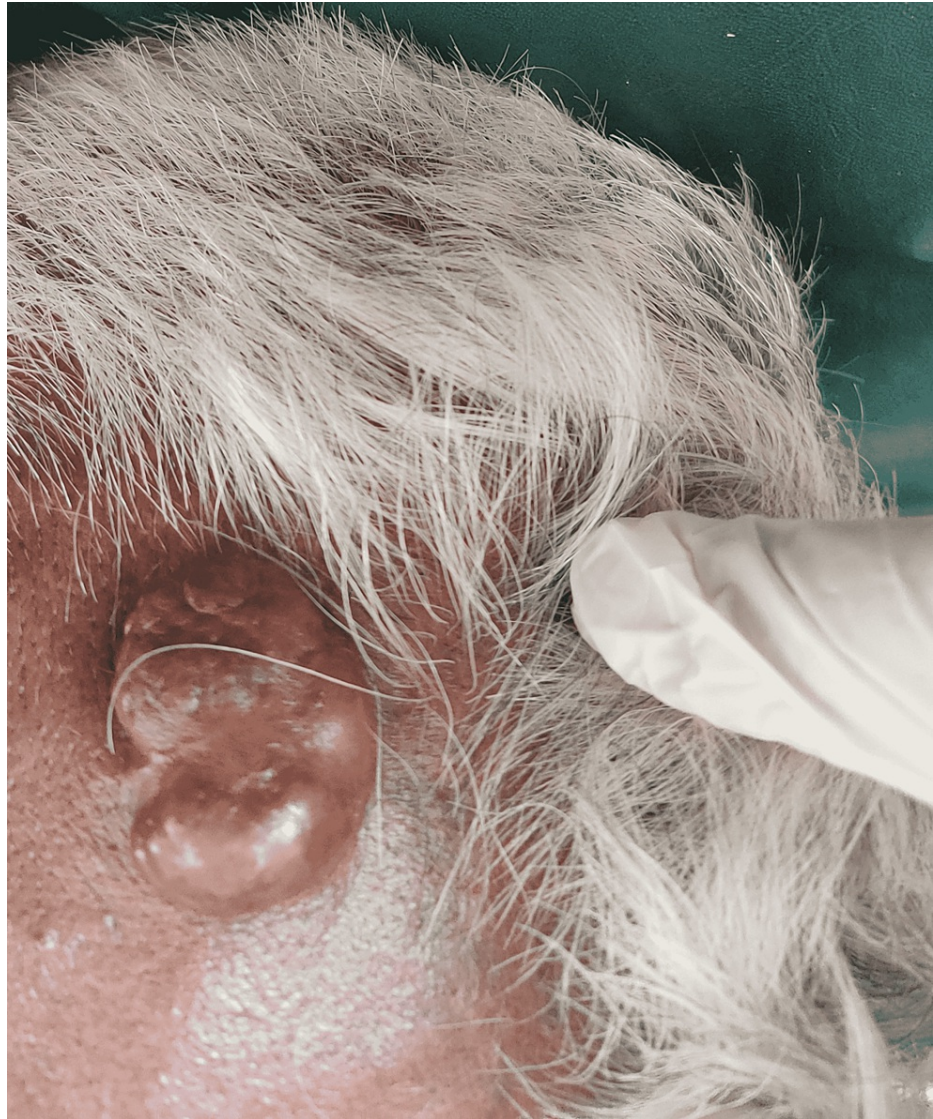
FIGURE 1: A nodular, bosselated swelling over the frontal region on the scalp.

It was firm in consistency. The skin overlying the swelling was unremarkable with no evidence of ulceration. On careful examination, no other swelling was identified anywhere else in the body. There was no evidence of regional lymphadenopathy. The patient was well built and well-nourished. Radiological investigations were not performed.