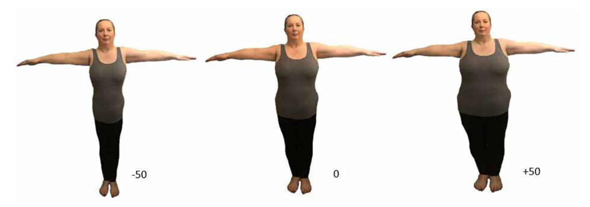
Fig. 1 Visual representation of the body distortion technique, using the Body Image Revealer (BIR); veridical (0 = original, centre), distortion (-50 = slimmer and +50 = fatter) of body size. Images of participants were viewed against a white background

use as covariates in our multivariate analysis and to avoid variance inflation due to multicollinearity amongst explanatory variables. We found four components, corresponding to the following: (i) the body part responses in the BUT (referred to henceforth as BUT-Parts); (ii) attitudinal responses in the BUT (referred to henceforth as BUT-Att); (iii) responses related to social pressure from the SATAQ-4 (referred to henceforth as SATAQ-Press); and (iv) responses related to internalization from the SATAQ-4(referred to henceforth as SATAQ-Int) (see Online Resource 2).