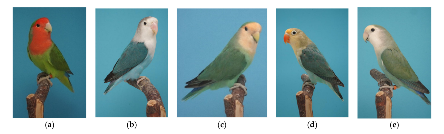
Figure 1. Five Agapornis birds: wildtype green A. roseicollis ( a ), a blue A. fischeri ( b ), an aqua A. roseicollis ( c ) and a sapphire A. fischeri ( d ) and a turquoise A. roseicollis ( e ).

In the "blue-series" of parrot coloration, phenotypes called "aqua", "turquoise" and "sapphire" are also found (see Figure 1 for some examples). There are no reports where the psittacofulvin has been quantified, but it is estimated that around 40–50% of the normal psittacofulvin pigment is produced in the feathers of aqua and turquoise birds [37]. These phenotypes, too, are inherited as autosomal recessive traits and further genetic studies are needed to show that the MuPKS gene might be linked to this inheritance pattern.