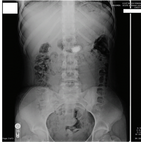
FIGURE 1: Supine abdominal X-ray showing watch in the stomach.