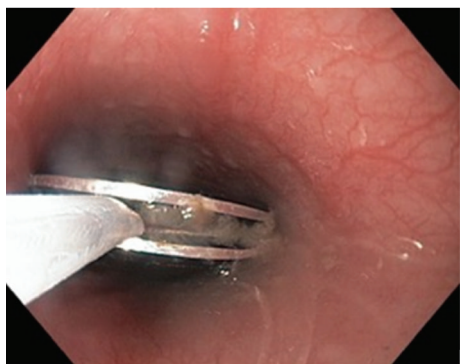
FIGURE 3: Successful end-on lassoing in the groove of the watch with the snare.

consent for the use of the images and information in this case report.