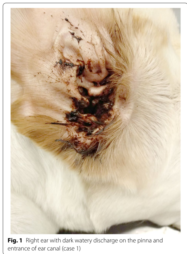
Fig. 1 Right ear with dark watery discharge on the pinna and entrance of ear canal (case 1)

All cases have the first follow-up after four weeks of starting treatment, except case 4. Case 1 was treated with alternate days of prednisolone at 0.5 mg/kg, oral ketoconazole at the dose of 5mg/kg daily and topical orbifloxacin, mometasone furoate monohydrate and posaconazole (Posatex®, Intervet; Boxmeer, the Netherlands) once a day into each ear. At the follow-up, otitis was resolved and treatment was stopped. Case 2 was discharged with oral prednisolone at 0.8 mg/kg q24h for 14 days then alternate days, oral ketoconazole 5 mg/kg daily, and topical Posatex® on affected ear q24h. At follow-up, there was Malassezia 1+ on the affected ear therefore, Posatex® was continued, ketoconazole stopped and the dose of prednisolone decreased to 0.4 mg/kg on alternate days until the second follow-up in 4 weeks. At that time, SMO was resolved and medication was stopped. Case 3 was treated with oral prednisolone at 0.4 mg/kg q24h for 14 days, then alternate days for 14 days. Topical Posatex® into each ear once a day and TrizEDTA® ear cleaner (Dermapet, US) three times a week. After one month, the left ear was normal and the right ear showed Malassezia