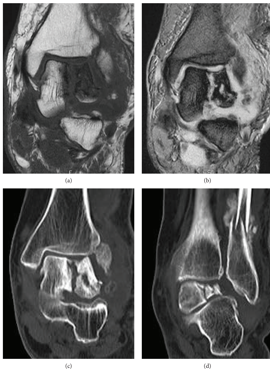
FIGURE 2: T1-weighted (a) and short-T1 inversion recovery (b) coronal magnetic resonance imaging of the left ankle showing a vertical fracture of the talar body and osteonecrosis of the lateral talar body fragment. Computed tomography images of the left ankle showing the comminuted fragments of the lateral talar body (c) and the fracture of the distal fibula with callus formation (d).

maintained the performance described above without complaint, although the comminuted lateral talar body displayed nonunion on radiography and CT evaluations.