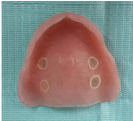
Figure 2: Maxillary complete denture with fixed RDS

Dentures were delivered to patients and they were instructed to maintain strict denture hygiene measures using cleansing tablets (Protefix, Queisser, Germany) once a day for 3 months.