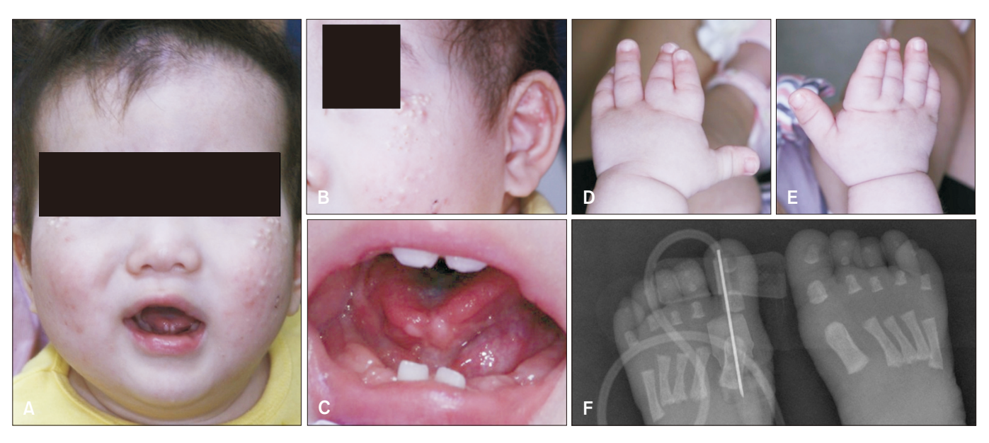
Fig. 1. (A) Presense of multiple milia on both cheek, predominantly on the left side. (B) Presence of multiple milia in the cheek as well as auricle. Partial hypotrichosis was also noted. (C) Shows bifid tongue and short frenulum. (D, E) Clino-brachy-syndactyly of hand were presented. (F) Anomalous deformities of both toes were seen on X-ray.